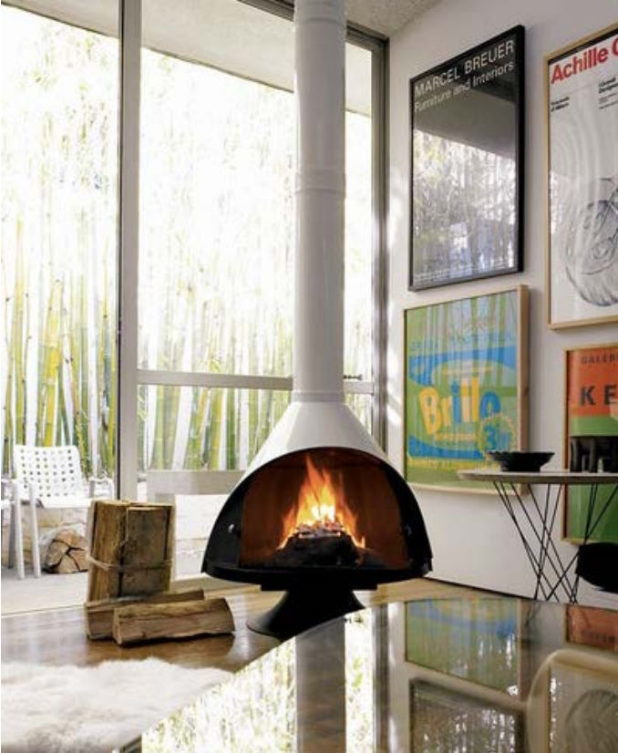
1/5 SHOP NOW: Fireplace by Malm, $2800, dwr.com

First though, you need to get shopping. Here are more styles we're loving right now . . .