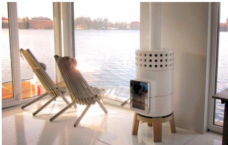
Photo: Courtesy of Wittus 3/5 SHOP NOW: Stack Stove by La Castellamonte, price upon request, wittus.com