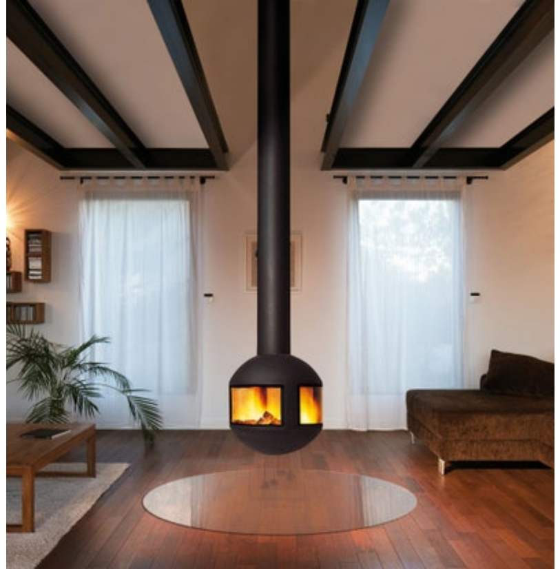
2/5 SHOP NOW: Agorafocus 630 by Focus Fires, from $15,705, europeanhome.com