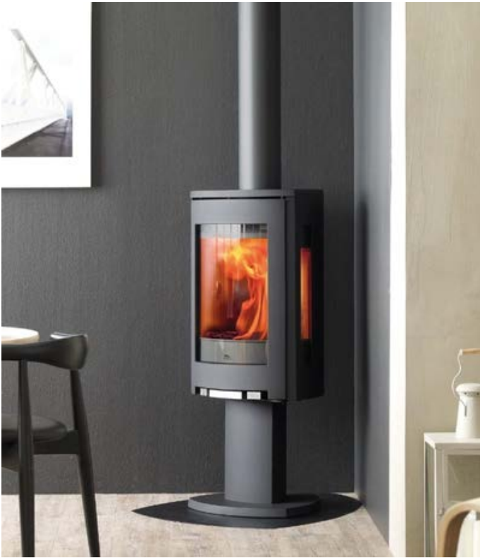
4/5 SHOP NOW: Jotul F 370 Wood Stove by Hareide Design, from $4,230, rockymountainstove.com (also available in gas; only ships to Colorado)